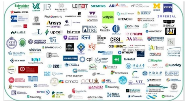
Logos of participating organisations